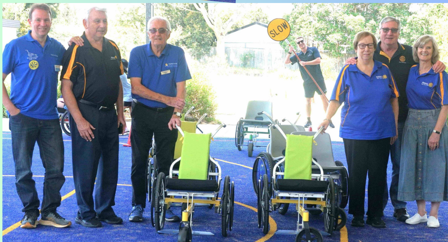
Fundraiser at Ferntree Gully North Primary School for Wheelchairs for Kids raised $6400