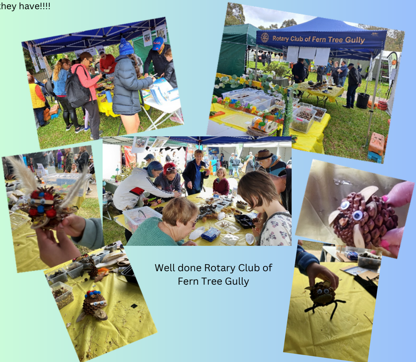
Well done Rotary Club of Fern Tree Gully

Take a glance at the Seed Pod Creatures created by our younger generation, What imagination they have!!!!