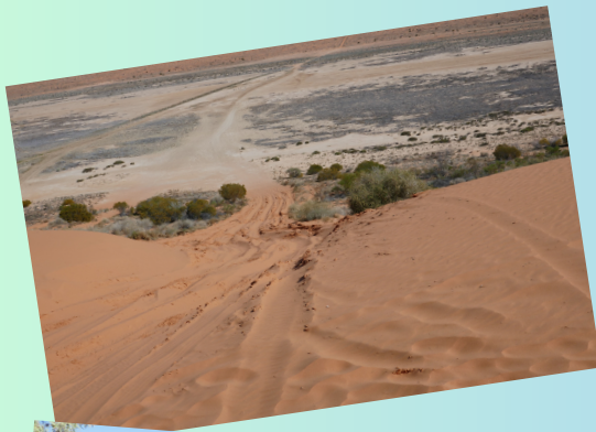
Paul And Jill's outback trek in the Simpson Desert to view the sunrise