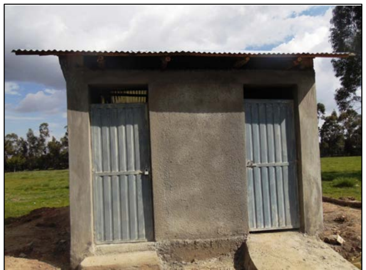
Shurmo Witbira Improved Ventilated Latrine funded by the 2017-18 District Grant